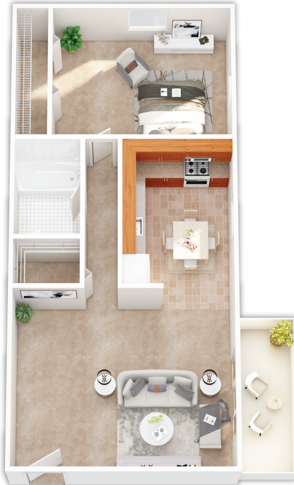
1 Bedroom / 1 Bath 615 sq. ft.

(p) 610.948.6160 • (f) 610.948.3213 • highviewgardens@altmanco.com 245 S. Cedar Street - A203 • Spring City, PA 19475