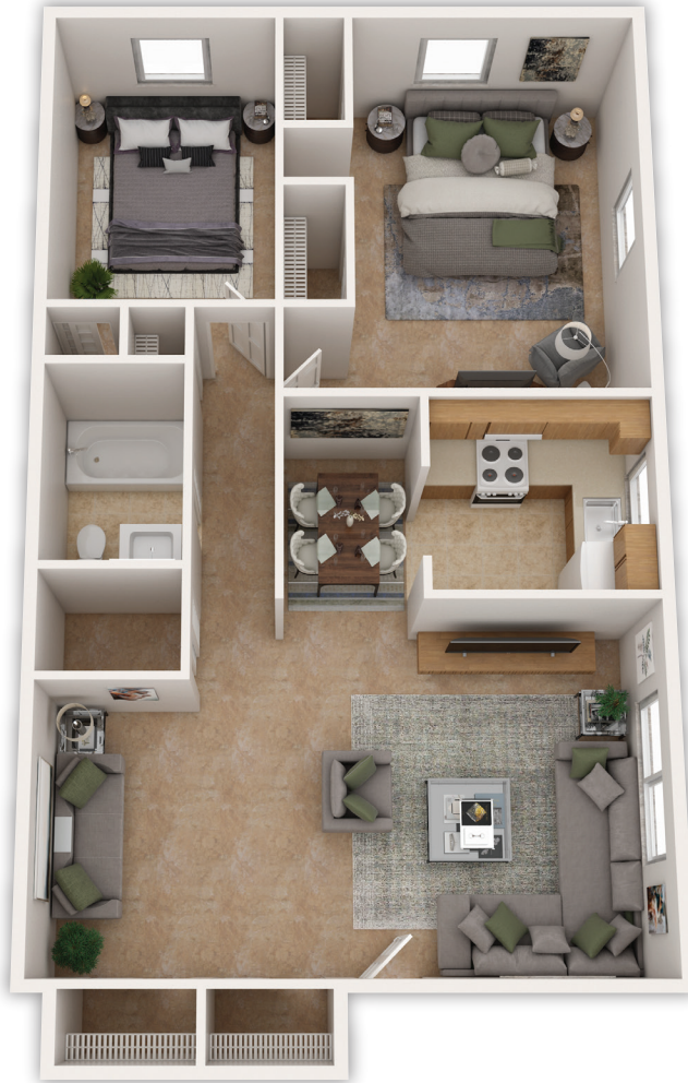
2 Bedroom / 1 Bath 820 sq. ft.

(p) 215.856.9400 • (f) 215.856.0466 • cedarglen@altmanco.com 9140 Old Bustleton Avenue - C111 • Philadelphia, PA 19115